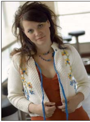
17807 Emroidered Cardigan, sizes XS - XL