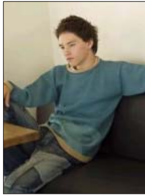
17810 Pullover, sizes S - XL