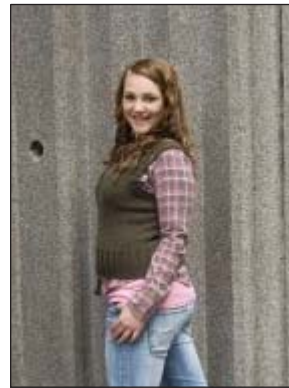
17811 V-Neck Vest, sizes XXS - XL