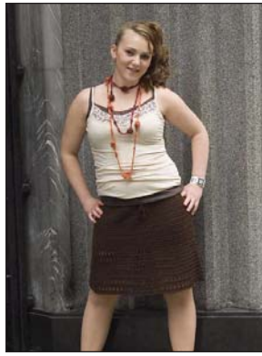
17808 Crochet Skirt, sizes XS - XL, & Necklace, one size