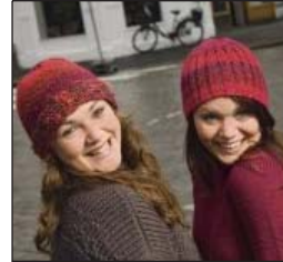
17812 Raglan Pullover & Striped Caps, sizes XS - XL