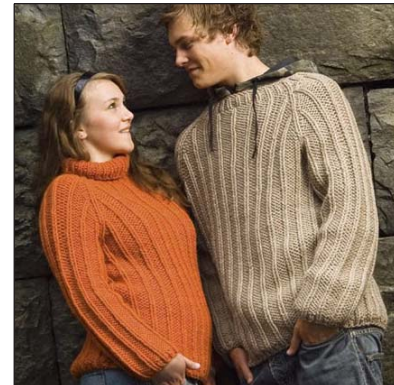
17814 Unisex Pullover, sizes XS - XXL