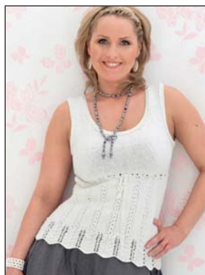
18810 Tank Tops, Crochet Hat & Purse, sizes XXS-XL Svale # balls C1 0010 Solid Top 6-8 C1 5135 Multi Top 1 C2 4417 1 C3 3608 1 C4 3108 1 C5 2005 1 C6 9425 4-7 C1 5135 Hat & Purse 5