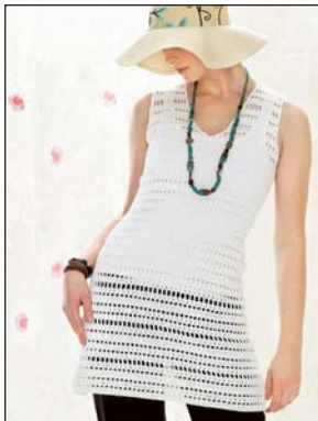
18808 Crochet Sleeveless Tunic & Cardigan, sizes XS - XL Svale # balls C1 0010 3812 Tunic 11-13 C1 0010 3812 Cardigan 15-19