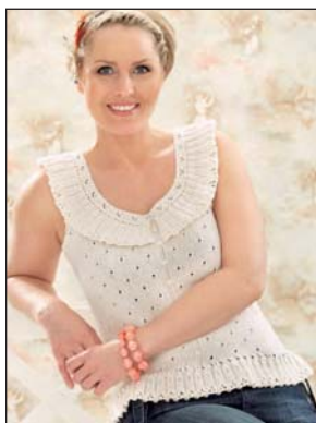
18809 Sleeveless Top, sizes XS - XXL Stork # balls C1 0002 6-8