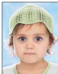
18807 Tunic, Pants & Cap, sizes 2 - 8 years Stork # balls C1 0004 Tunic & Cap 3-4 C2 0006 1 C3 0001 2-3 C1 0004 Pants 1 C2 0006 2-3 C3 0001 1