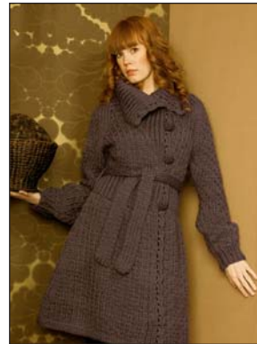
8403-11 Coat, one size Hubro C1 2671 1700 gr