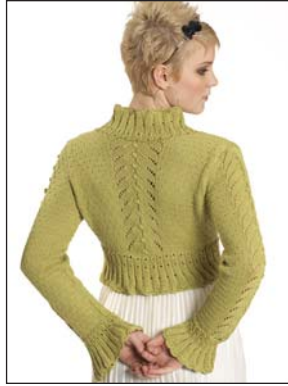
8403-8 Long or Short Cardigan & Cap, sizes XS - XL Lerke # balls C1 9626 5063 9-16