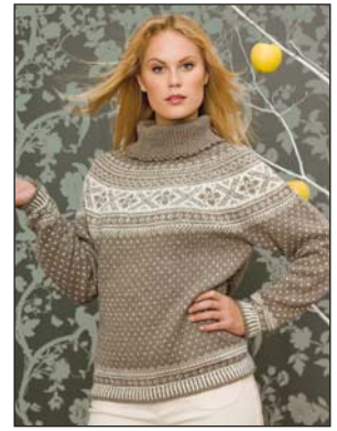
8403-9 Yoked Pullover in 2 lengths & Cap, sizes XXS - XXL Heilo or Falk # balls C1 3841 0090 8-13 C2 0017 2671 3-5 Embroidery colors 4536 4845 rem 4227 4227 rem 9133 9335 rem 9155 9155 rem Wrist warmers, one size Falk or Heilo C1 9725 5036 2