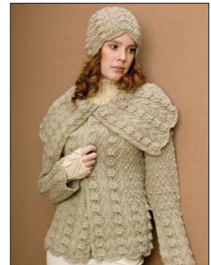
8403-13 Cardigan, Pullover, Cap & Cowl Collar, sizes XS-XL Falk or Heilo # balls C1 5533 9331 Cardigan 16-20 C1 5533 9331 Pullover 13-17 C1 5533 9331 Cowl Collar 3 C1 5533 9331 Cap 2