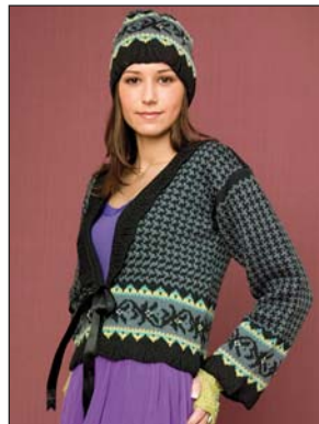
8403-12 Cardigan & Cap, sizes XXS - L Daletta or Stork # balls C1 0090 7-9 C2 9725 2 C3 6943 2 C4 5762 4-5