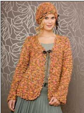
8403-10 Cardigan, Vest, Cap & Purse, sizes XS-XL Ara # balls C1 2426 5655 Cardigan 13-17 C1 23063 29280 Vest 9-11 C1 2426 5655 Cap or Purse 2 23063 29280 2